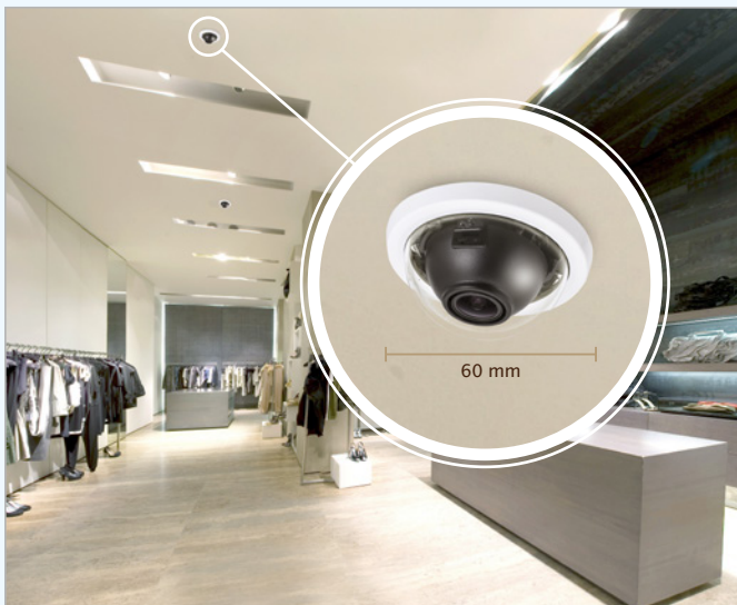
The World's Smallest Recessed Mount Fixed Dome Network Camera