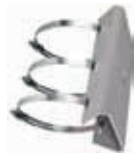
DP-1275ZJ Vertical pole mount